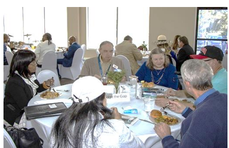
Bridge The Gap Ministries