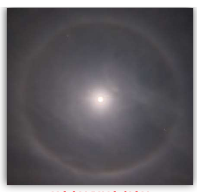
MOON RING SIGN

God spoke to my heart: rally together all Gwinnett pastors for intercessory prayer for Gwinnett County and our nation in lieu of our upcoming 2024 election. Pastors united in prayer can be a platform for a county wide Pentecost. I have to keep reminding myself, "Nothing is too hard for God!" Before Pentecost came, they were all together in one place. Prayer unites us all under His agenda, not our schedule or plans.