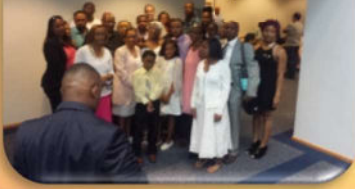
Praying over weddings in full array