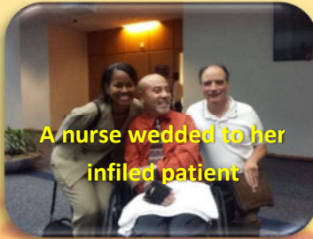
A nurse wedded to her infiled patient