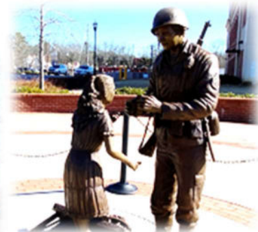
STATUE OF COMPASSIONATE LOVE IN FRONT OF THE FORSYTH CO. COURTHOUSE

January 28, 2020 The first historical prayer walk around 7+ times at the Forsyth County Courthouse.