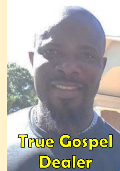
True Gospel Dealer