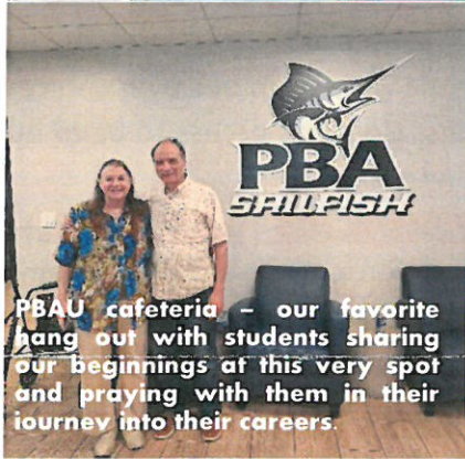
PBAU cafeteria – our favorite hang out with students sharing our beginnings at this very spot and praying with them in their journey into their careers.