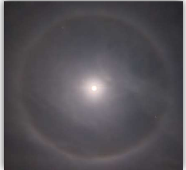
MOON RING SIGN

Our new Gwinnett County logo that came out a few years ago was so inspiring. I saw the colors symbolizing God’s perfect Trinity within. That is exactly who we seek to exalt at our county seat. A few weeks ago walking outside of my home I turned around for some reason only to see the most beautiful display of our moon and the ring circling it. God spoke to my heart: rally together all Gwinnett pastors for intercessory prayer for Gwinnett County and our nation in lieu of our upcoming 2024 election. Pastors united in prayer can be a platform for a county wide Pentecost. I have to keep reminding myself, “Nothing is too hard for God!” Before Pentecost came, they were all together in one place. Prayer unites us all under His agenda, not our schedule or plans.